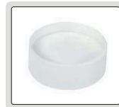
optical flat (included)