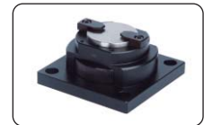
slice holder (included)