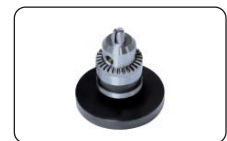
cylinder holder (included)