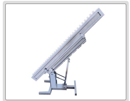
can be used with stand