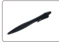
touch pen (included)