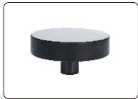
Ø63mm flat anvil (included)