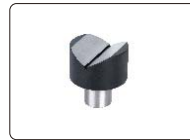
V-type anvil (included) for cylinders with diameter Ø4~60mm