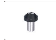
small V-type anvil (optional) for cylinders with diameter Ø2~4mm