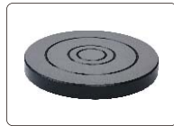
Ø150mm flat anvil (included)